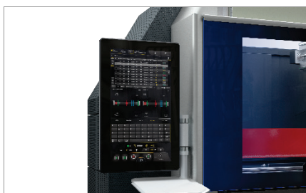
Dynamic double operation 05